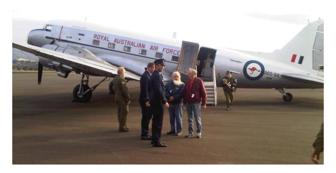
Back on the ground after a memorable bonus!